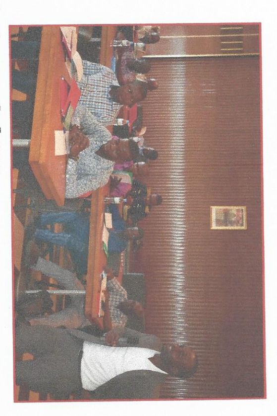
Trainers with participants during workshops