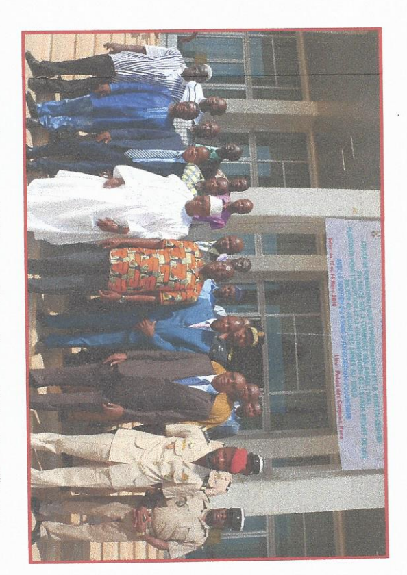
Workshop of Kara Region (7) in Kara, from 12 to 14 march 2018