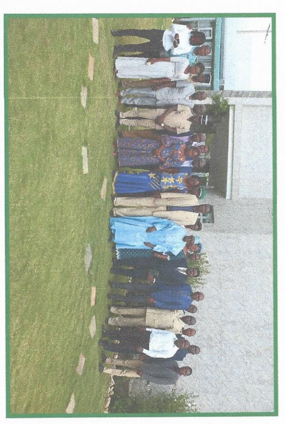
Workshop of Plateaux-Ouest Region (3) in Kpalimé, from 20 to 22 november 2017