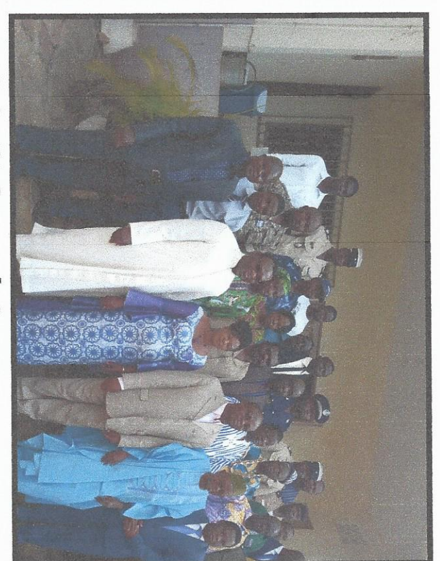
Participants in a practical exercise Page 13 of 14