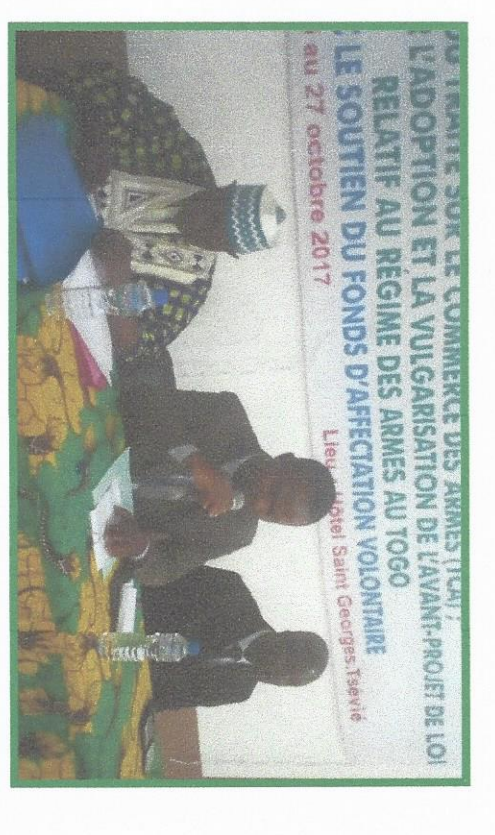
Workshop of Maritime Region (2) in Tsévié from 25 to 27 October 2017