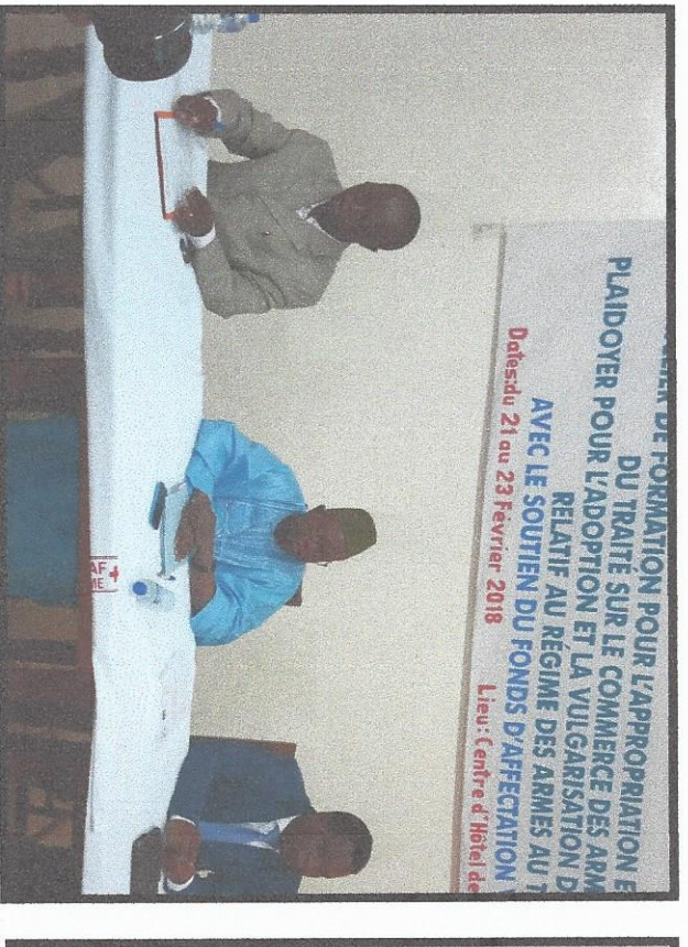
Workshop of Plateaux-Est Region (4) in Atakpamé, from 21 to 23 february 2018