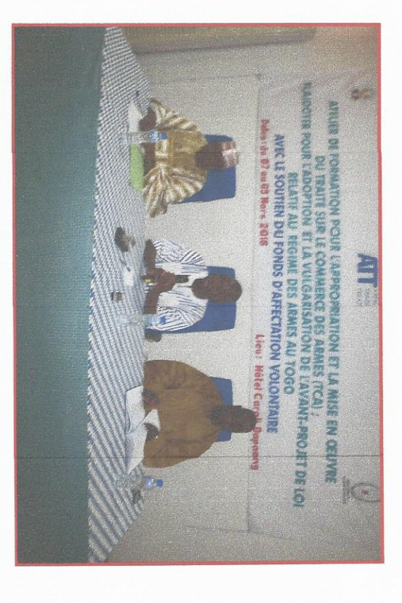
Workshop of Savanes Region (6) in Dapaong, from 07 to 09 march 2018